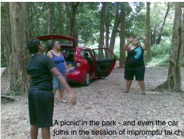
A picnic in the park - and even the car joins in the session of impromptu tai chi