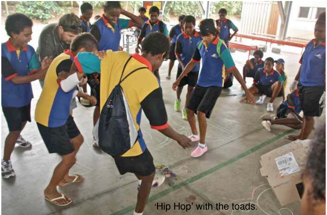
'Hip Hop' with the toads.