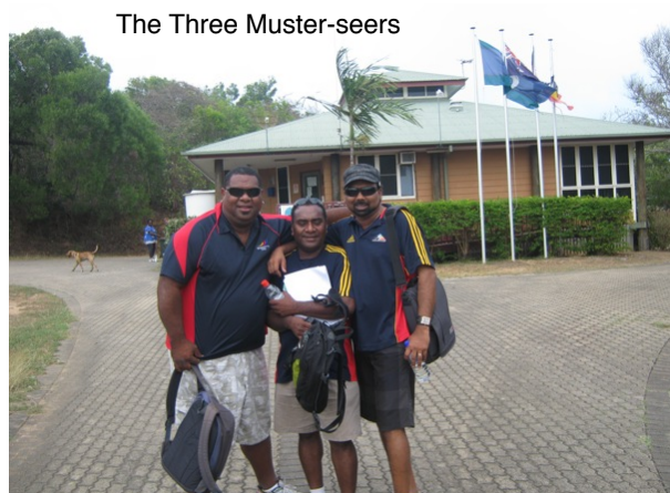
The Three Muster-seers