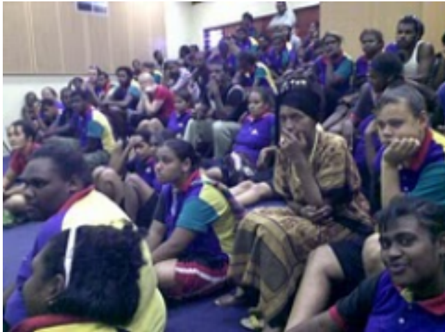
Djarragun Senior School students taking time to find out where to direct their attention for this year's busy programme

Catering for this particular phenomena demands the relative increase to staff, facilities and resources. Some students seem to have developed a territorial fixation to the school and the increase in Courses to the upper sector prompts work stations that will accommodate this educational renaissance.