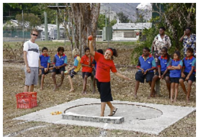
(right) Shot putt in three easy lessons