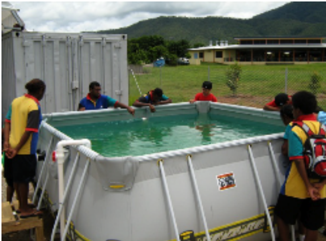
Weekdays provide many watchful eyes over the fish tanks