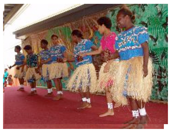
(ABOVE) Primary boys and girls give the stage the once over - threatening the monopoly of the Senior dancers : there's a new force in town !!